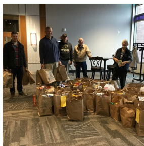
Cornerstone Lutheran celebrated their 2nd year of service to the pantry by collecting 1,511.6 pounds of food. Thank You!