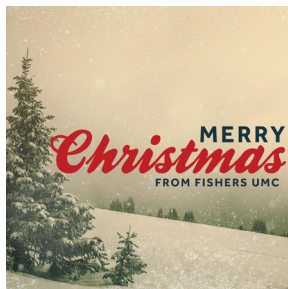
Today in the town of David a Savior has been born to you; he is the Messiah, the Lord. Luke 2:11