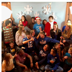
Jr. High and Sr. High Students had their annual Christmas Party!